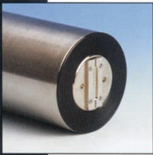
EM-Printhead small (7 nozzles)