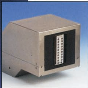
Piezo-Printhead small (192 nozzles)