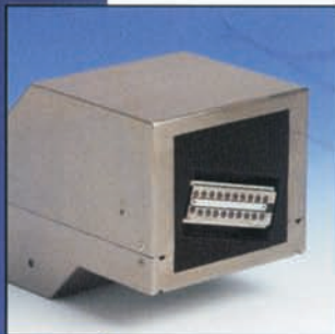
Piezo-Printhead big (352 nozzles)

The EBS 1500 series are controllers that operate modular, separate from the print-head. The available printheads are in a high quality steel housing and with Electromagnetic-technology (EM - up to 64 dots) or with Piezo-technology (Piezo - up to 352 dots).