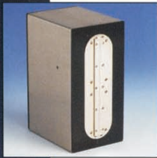
EM-Printhead big (64 nozzles)